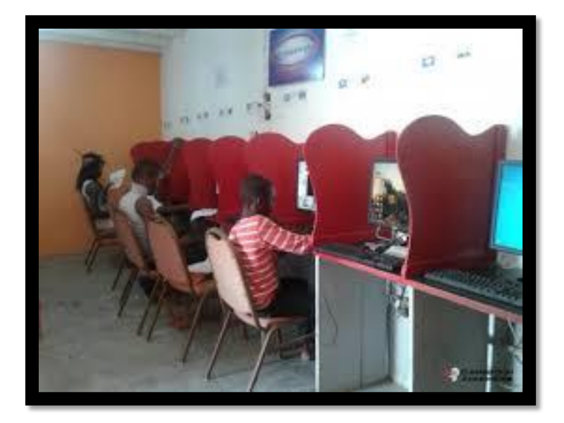
Figure 9: Children in the cyber cafe

The cyber café constitute the usage of the information and communication technologies but the problem is what usage is made of it as there is neither control nor guidance of the practices of users. It is now left to the school authorities to make children respect the prescribed norms of usage of these tools wherever they find themselves on the computer. These centers, if exploited in the positive use will be advantageous to learners because there are well equipped with high internet debit which facilitate research and easy access to quality knowledge. These centers can be used to complete the work pupils could not do at school because of limited number of ICT resources. Beche (2013). The cyber café saves as an alternative to poorly equip multimedia centers in school. It permit learners to realize what was difficult to do in school. For those who have computers at home, there are certain things they will not be authorize to do at home so they will visit the cyber café in search for freedom to do what they want on the computer. Sometimes the connection at home may not be the best for them to do their work so they will find themselves at the cyber café for quality services. For these reasons, the cyber café is consider as a favorite point to access these tools by learners. It is at the same time