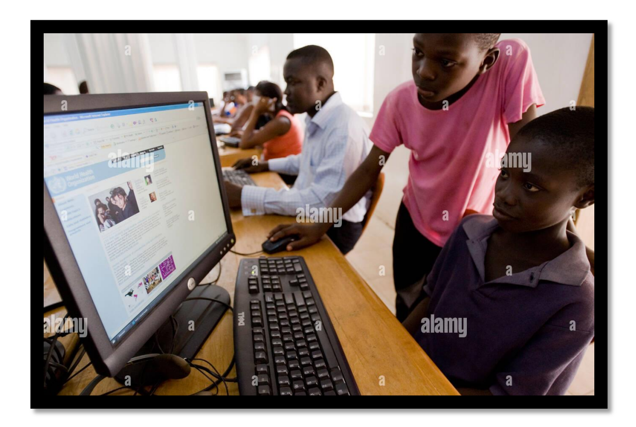
Figure 6: Learners sharing their experience

to the complexity of use of these tools, different types of use are observed. This is through the way learners see it, their opinion, attitude and appreciation of these technologies. The utilization of computerized tools enhance the effectiveness of basic education in this case. It gives pupils greater control over their learning and help them develop skills. The goal of the government is to produce citizens who understand how to use a computer in order to foster their education, reflect and develop their idea, to meet up with present day challenges in education. Pupils are encouraged to work together, share idea, competence and skills for fast and better understanding.