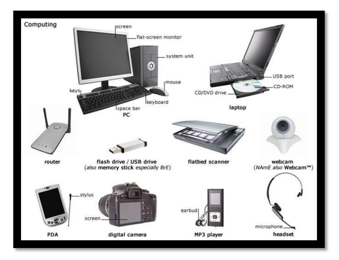
Figure 2: The various ICT tools