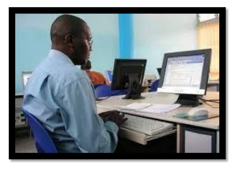
Figure 4: A teacher preparing his lessons

Political actors and managers of education are in search of solutions to make teaching be of quality and accessible to the greater population. This is within the context of liberalization and democratization of education which involves easy access and acquisition of knowledge with the use of the information and communication technologies. In the past, when the traditional method of teaching was used, access to knowledge was not easy. Today, teachers are trained in the use of these modern technologies in teaching. The teacher can hence forth accompany the pupils in the creation and development of new knowledge, all this on a collective platform that is shared online. This new method constitutes a significant progress in the process of teaching and learning as well as in the transfer of competence. The information and communication technologies will facilitate access to knowledge both to teachers and learners. Teachers who are well trained to that effect will improve their capacity as well as that of the pupils under their guidance. The internet helps the teacher to revolutionalise his teaching practices and easies the circulation and stockage of knowledge for the interest of research, anywhere and at any time as need arises. Educators use ICT to conduct research with the objective to better prepare their lessons. This will help to improve the quality of knowledge leading to enhanced and updated professional knowledge.