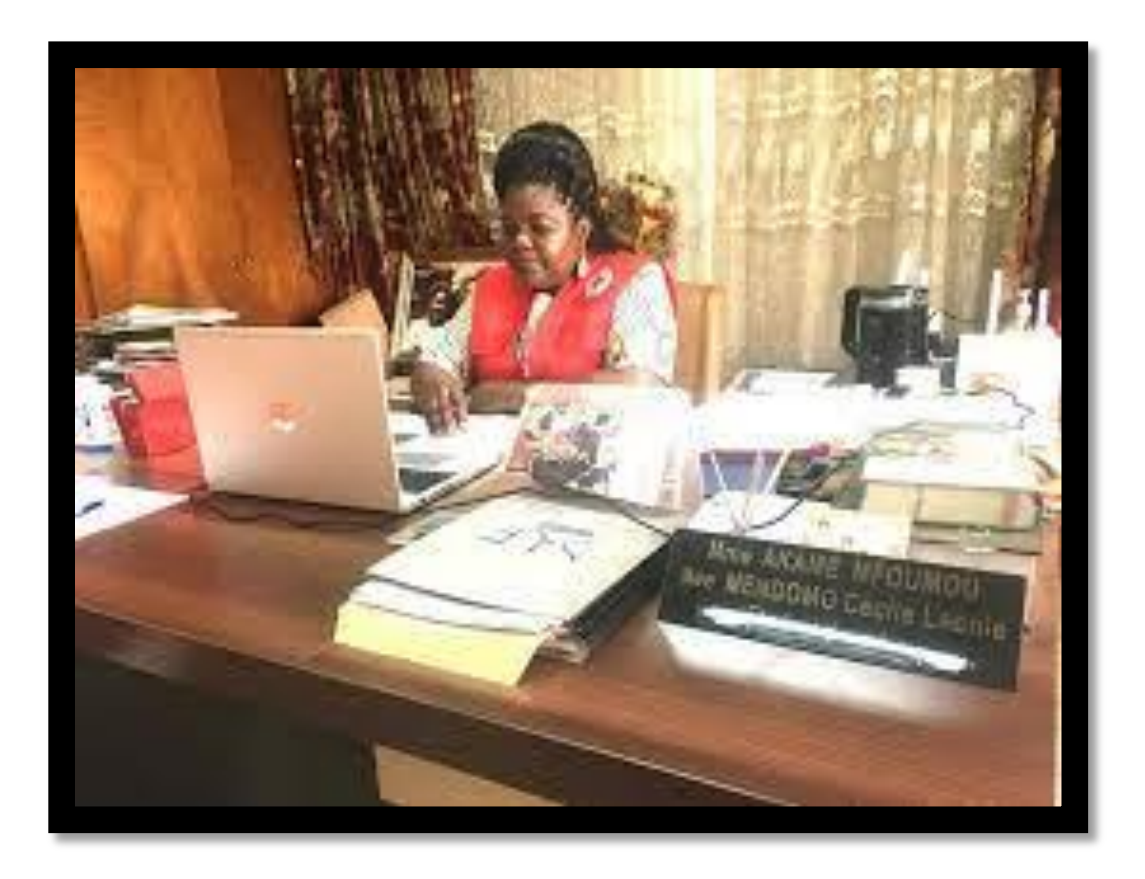
Figure 11: The computer assists school management in their daily practices.

management in terms of flexibility, mobility, productivity, collaboration, organization and planning, Beche (2013)