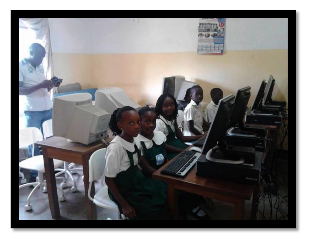
Figure 5: Pupils in the multimedia center

The integration of ICT in the system of education especially at the primary level, has brought a change in the teaching and learning process. The government therefore finds it necessary to train teachers in the use of these technologies, which provides diverse opportunities for new knowledge, Matoussi (2006). Consequently, the training and recycling of teachers is of great necessity for an effective pedagogical integration of ICT. It should be noted that, it is through the teachers and its competence that the expected results of the integration of ICT in education will be realized. So with the potentialities that these new technologies offer, education is having great chances of ameliorating its practices and give it the quality it deserves, Matoussi. (2006). This can only be possible in the context where sufficient attention is paid to the provision of the infrastructure and tools that will enable its exploitation by the actors concerned for the interest of teaching and learning.