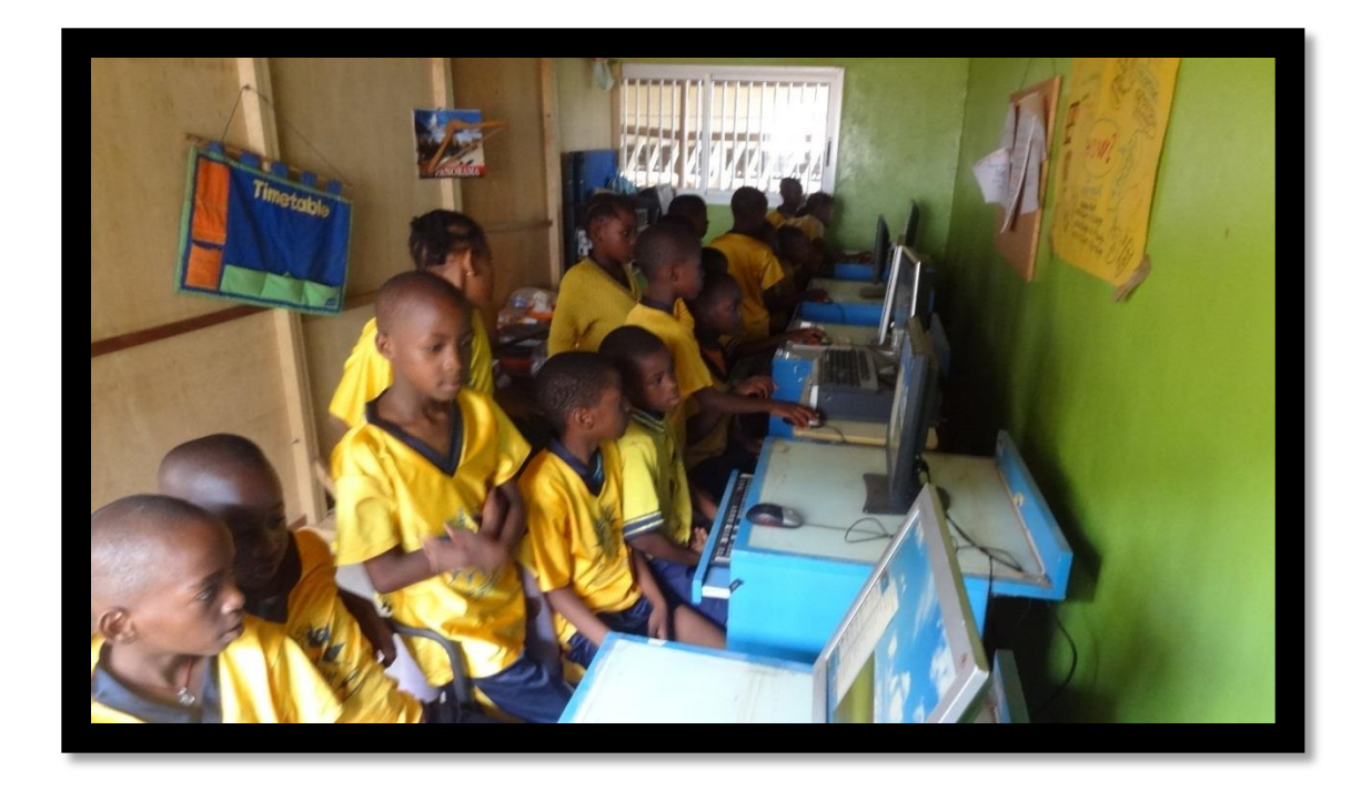
Figure 7: Limited computers for many pupils at the multimedia resource center

An effective pedagogical integration of ICT demands an appropriate use of these technologies in school. In this case, the use of these tools is to facilitate the process of teaching and apprenticeship in school, Karsenti T and Larose F, (2005). How these tools are used by the different actors is what matters in this process. The study of the use of these technologies by learners is given much attention and importance today especially at the basic level, where the administrators see to it that a good foundation is laid. So the study of the dynamics of the appropriation and use of this technological dispositive is given priority. What do learners do effectively with these objects and how does their action enhance the process of education? This will throw more light and possibilities to study the stakes and challenges in the social representation and appropriation of these technologies and their integration in the primary school.