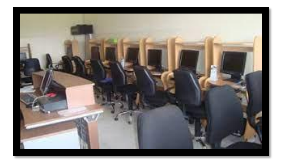
Figure 10: Modern well equipped cyber café

It is the duty of a teacher to make learners know what information and communication technologies signifies to them especially in the process of learning in this era of digital technologies. Reason being that these numerical tools have an influence, an impact and great repercussion on the system of education today. These tools offer possibilities that facilitate communication, learning opportunities and freedom of expression. Either used negatively or positively, it is a fact that these numerical technologies are hence forth part of the daily lives of citizens. The reason why these pupils must know the danger that the misuse of these tools represent. Misappropriation will destroy the objective of these innovation. So they should be made to understand that obeying the prescribe use is obligatory wherever they find themselves on the computer, be it at home or at the cyber café because it is for the interest of their studies and of education in general.