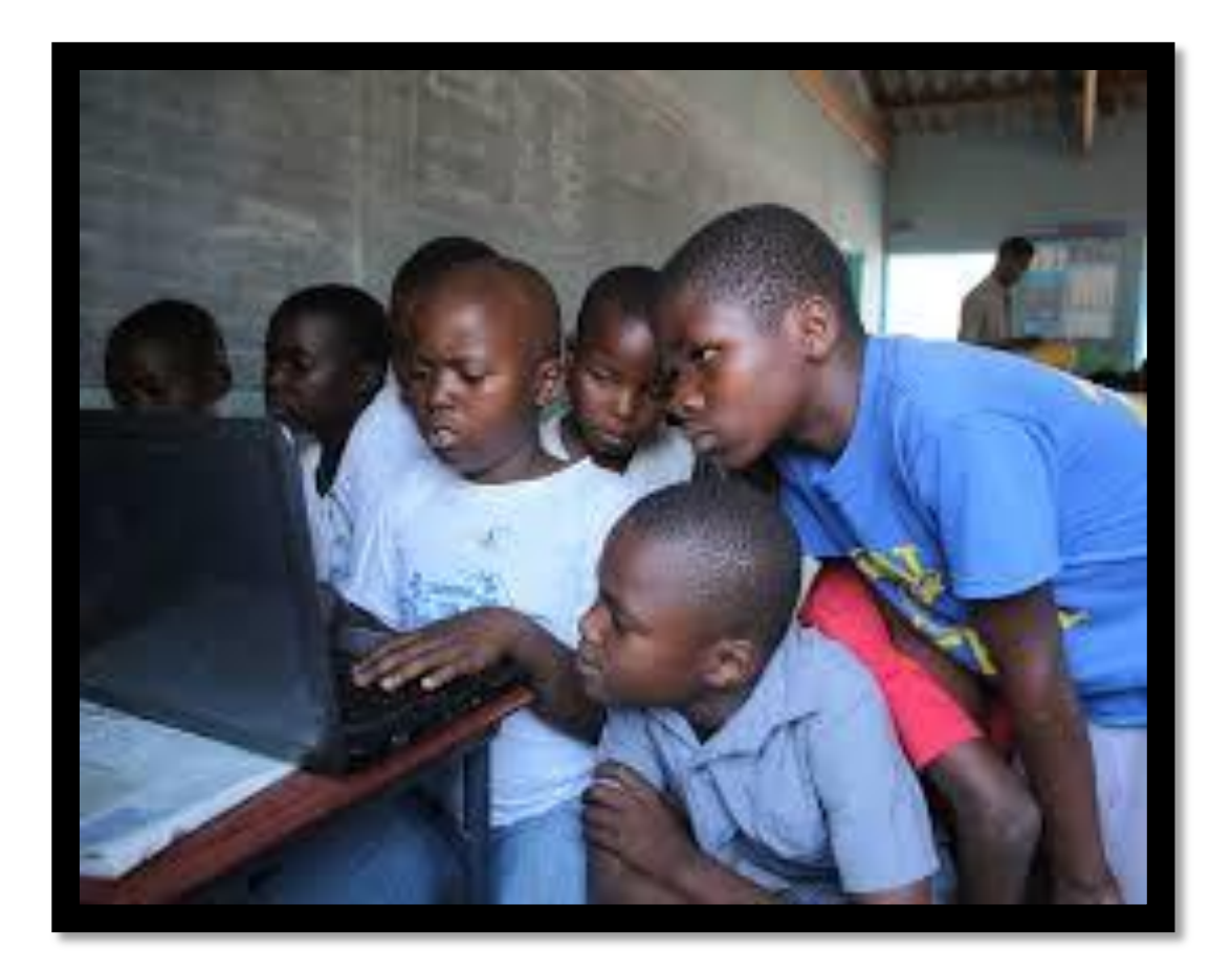
Figure 8: Collective work on the computer by learners

In the Government Bilingual Primary School Bastos -Yaoundé, if a pupil or a group of pupils is caught going against the prescribed rules of use, they are given corporal punishment. If it concerns the viewing of pornographic films, in addition to the corporal punishment, their parents are summoned to school and advice to ensure proper guidance at home. The headmistress admitted that such cases have been recorded in her school, though so few. They are doing their best not to have such cases any longer, she confessed. As for the teachers, they say such cases can only happen behind them since the pupils are many as compared to the number of machines available. In such a situation, they can easily do something else when the teacher is occupied at the other end of the class. That notwithstanding, she says they are doing what they can to limit deviant practices through sanctions and counselling. The sanctions, counselling and other disciplinary measures are the joint responsibilities of the school administration consisting