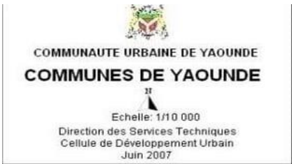
Figure 1: Map showing the location of Yaounde IV subdivision